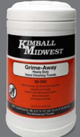
Grime Away 80-995