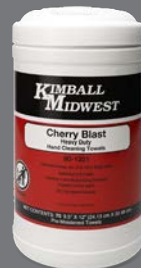
Cherry Blast Hand 80-1221