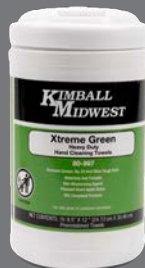
Xtreme Green 80-997