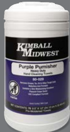
Purple Pumisher 80-029