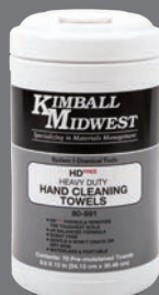
HD Free 80-991