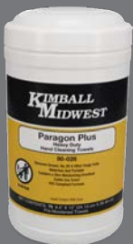
Paragon Plus 80-026