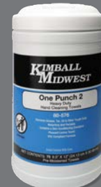
One Punch 2 80-576