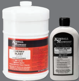
Cherry Blast White