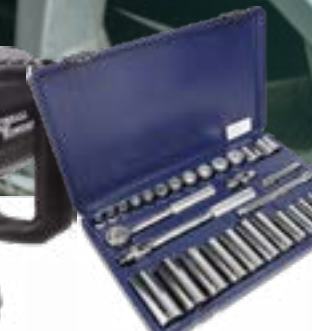
D 3/8" Drive Standard & Deep Socket Set