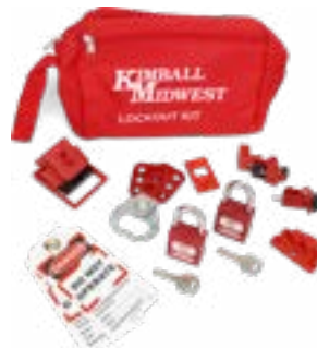
83-3412S $137.63/ea Electrician Lockout Kit Qty. 1