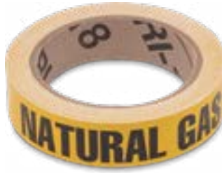
C Pipe Markers