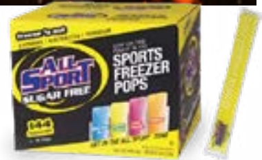
D Box of 144 Freezer Pops