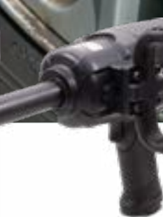
C 1" Impact Gun w/ 6" Extended Anvil