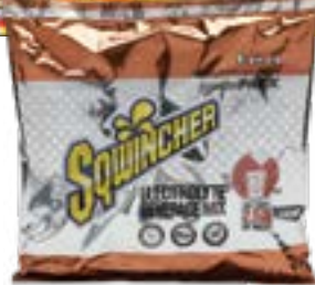
B 2.5 Gallons Sugar Free Grape