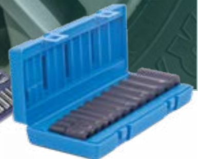
E 3/8" Deep 6 Point Drive Impact Socket Set