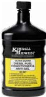
F Ultra Guard™ Diesel Fuel Conditioner