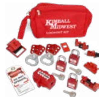
83-3413S $178.29/ea Large Electrician Lockout Kit Qty. 1