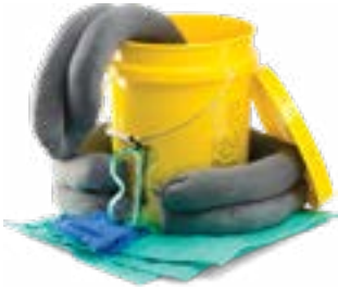
A Grab & Go Portable Kit