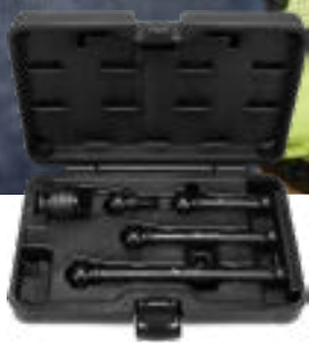
A Quick Change Impact Swivel Extensions