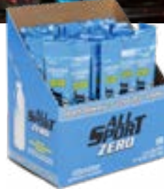
C Sugar Free Blue Raz