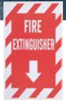
E Fire Extinguisher