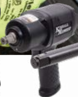
B 1/2" Impact Gun