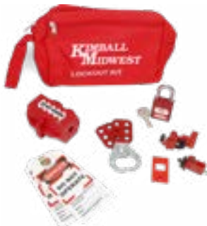
83-3411S $107.75/ea Starter Lockout Kit Qty. 1