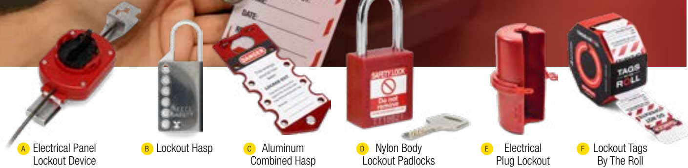
A Electrical Panel Lockout Device