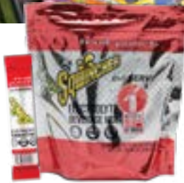
A Fruit Punch Qwik Stik®