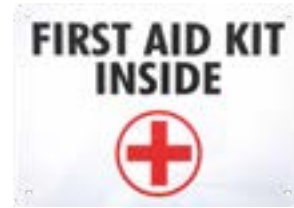
D First Aid